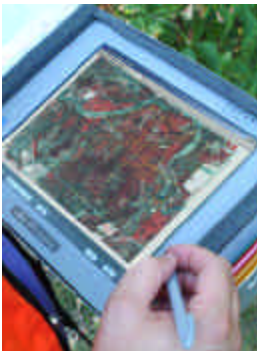
Figure 2. Fujitsu Stylistic 3500 pen-based computer.

Several pen-based computers are currently on the market that are ideal for forest management tasks. To assist in a comparison of current handhelds, researchers at the University of Minnesota's Department of Forest Resources categorized them based on size - small, medium and large. Table 1 summarizes differences between these sizes.