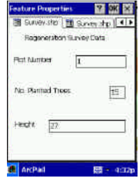
Figure 3. Customized data entry form for a regeneration survey.

When multispectral imagery (with red and near infrared spectral bands) from digital cameras or satellite sensing systems is available, the normalized difference vegetation index can be a useful image transformation. NDVI is sensitive to the amount of green vegetation and enhances differences between vegetation and other cover types.