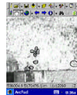
Figure 6. NDVI-derived map of healthy and non-healthy vegetation. Delineated “holes” are unhealthy (or absent) vegetation.