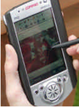
Figure 1. Compaq iPAQ handheld computer.

can reduce the amount of labor needed by equipping fewer people with more user-friendly, capable tools for data collection, analysis and interpretation. Lastly, managers can reduce the likelihood of data collection error by creating customized data input tables that contain only correct entry options and by avoiding the task of manually transferring data from the field to the office.