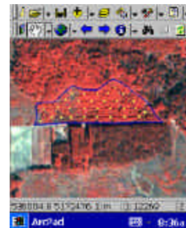
Figure 5. Stand boundary with traverse and sample plot centers.

This fact sheet was compiled by Sarah R. Finley, Editor, Department of Forest Resources, University of Minnesota